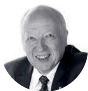
Councillor Carl Les (Con) is Leader of North Yorkshire County Council