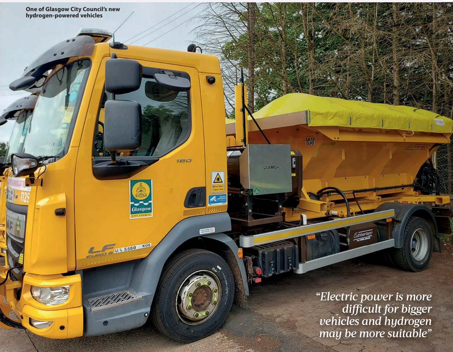
One of Glasgow City Council's new hydrogen-powered vehicles

“Electric power is more difficult for bigger vehicles and hydrogen may be more suitable”