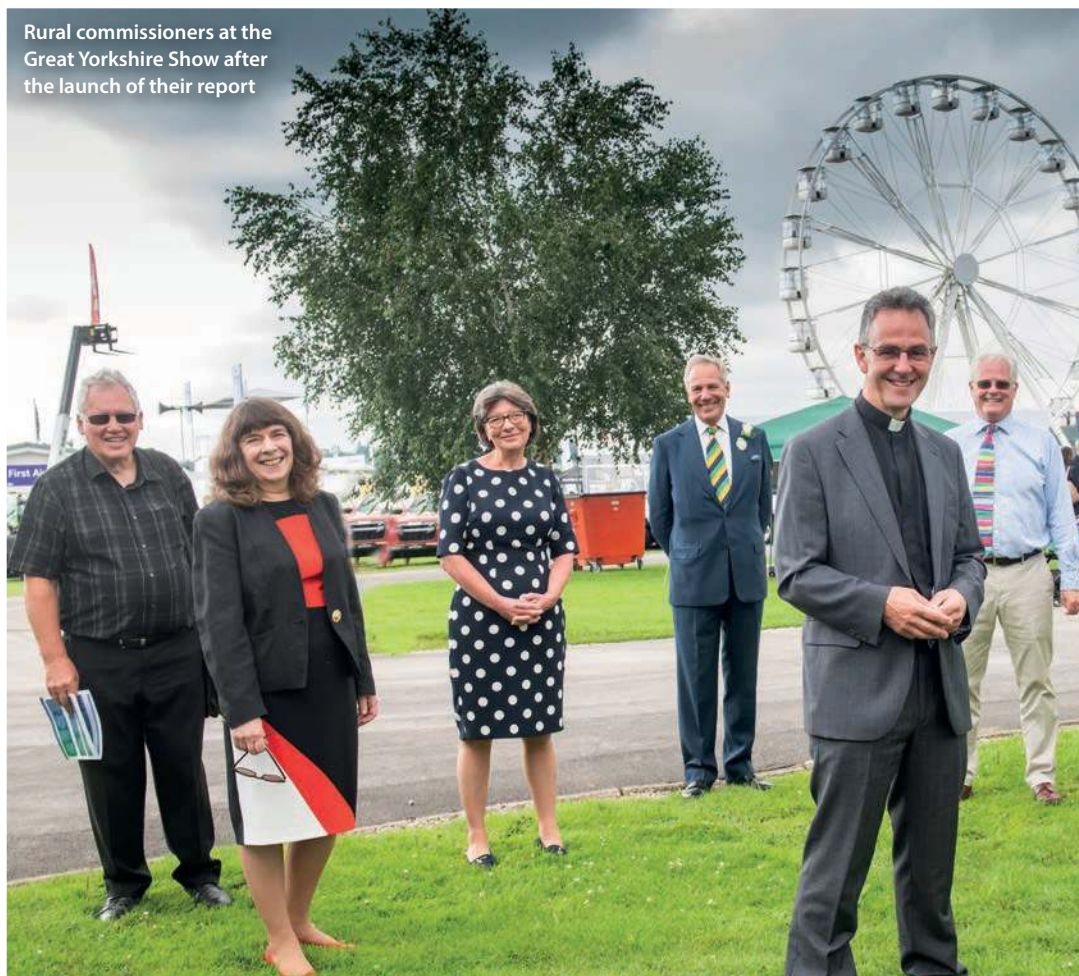
Rural commissioners at the Great Yorkshire Show after the launch of their report

To find out more about the new North Yorkshire Council , please visit www.northyorks.gov.uk/stronger-together