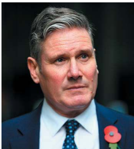
Sir Keir Starmer MP, Leader of the Labour Party