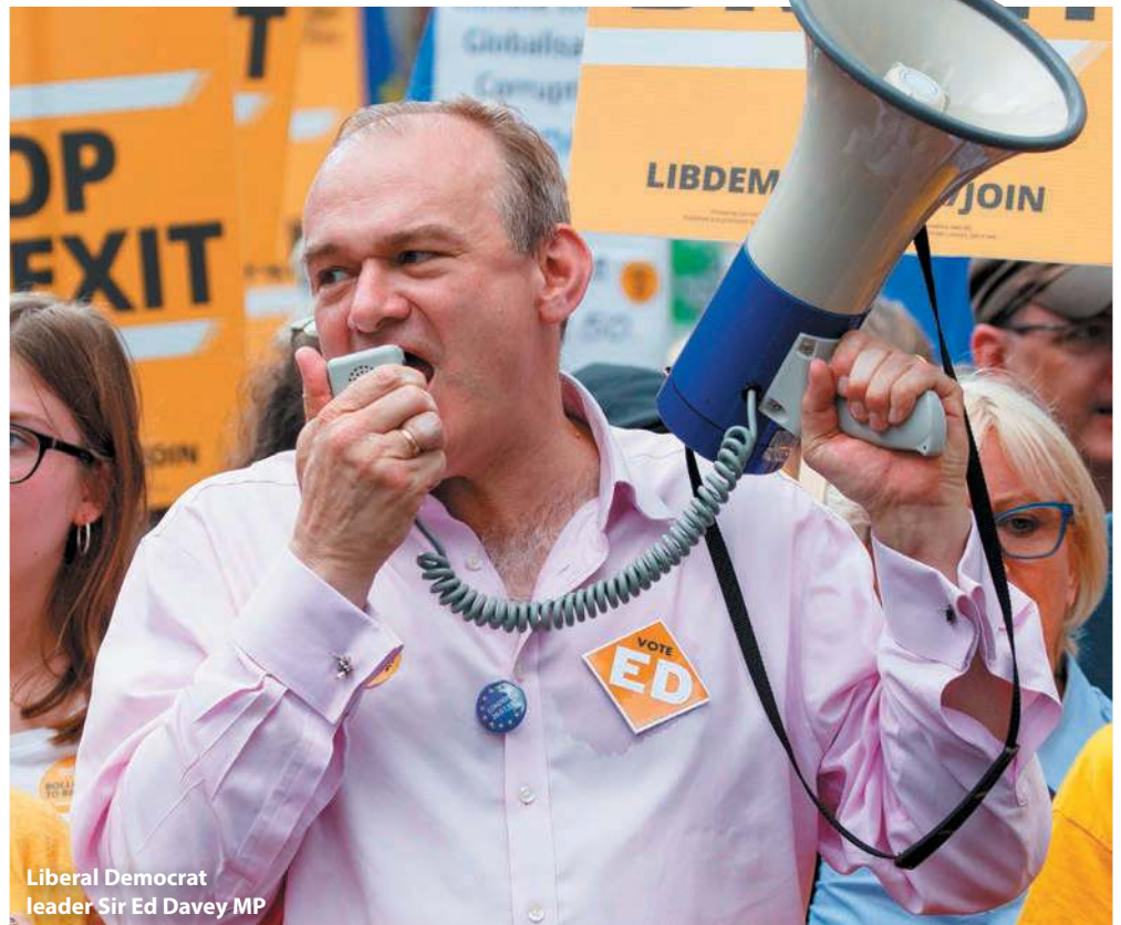
Liberal Democrat leader Sir Ed Davey MP

We look forward to working with our fantastic leadership team to make this a reality.