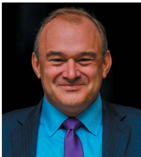
Sir Ed Davey MP, Leader of the Liberal Democrats