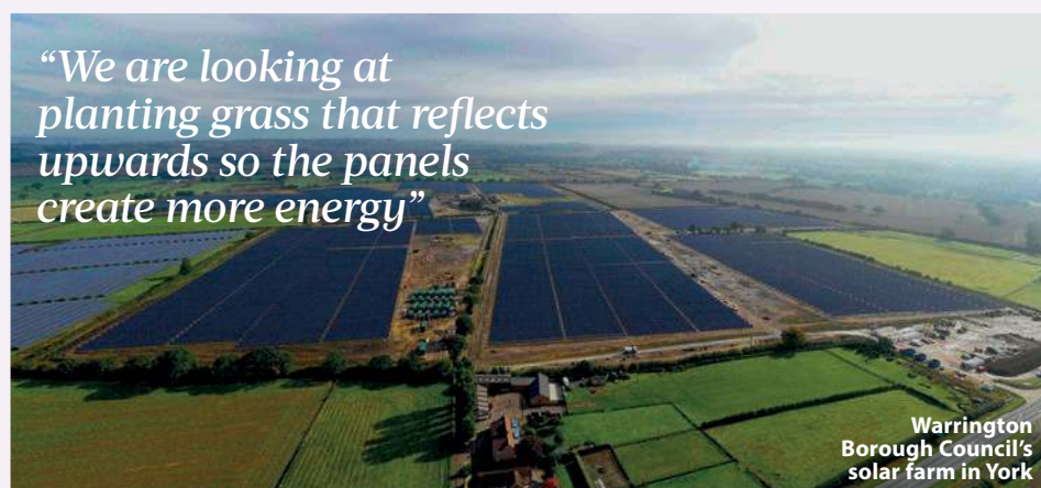
Warrington Borough Council's solar farm in York

"We are looking into planting special grass that reflects upwards so the panels can generate more electricity. Most people put