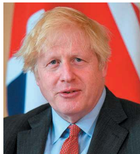
Boris Johnson MP, Leader of the Conservative Party

i For the latest information on LGA events at the party conferences, please visit www.local.gov.uk/parliament/party-conferences-autumn-2021