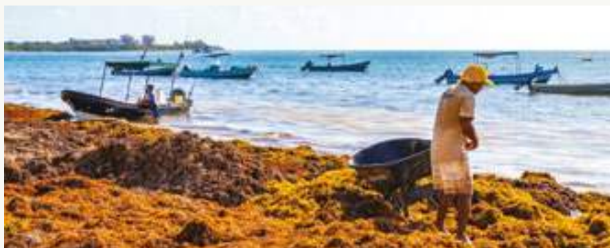
Workers cleaning the beach at Playa del Carmen, Mexico