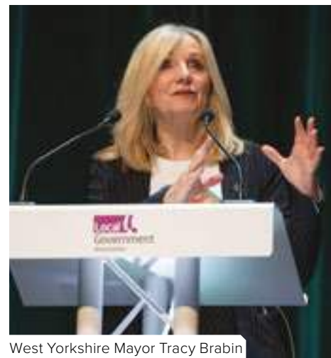
West Yorkshire Mayor Tracy Brabin