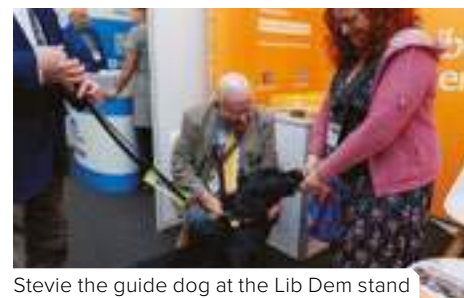
Stevie the guide dog at the Lib Dem stand