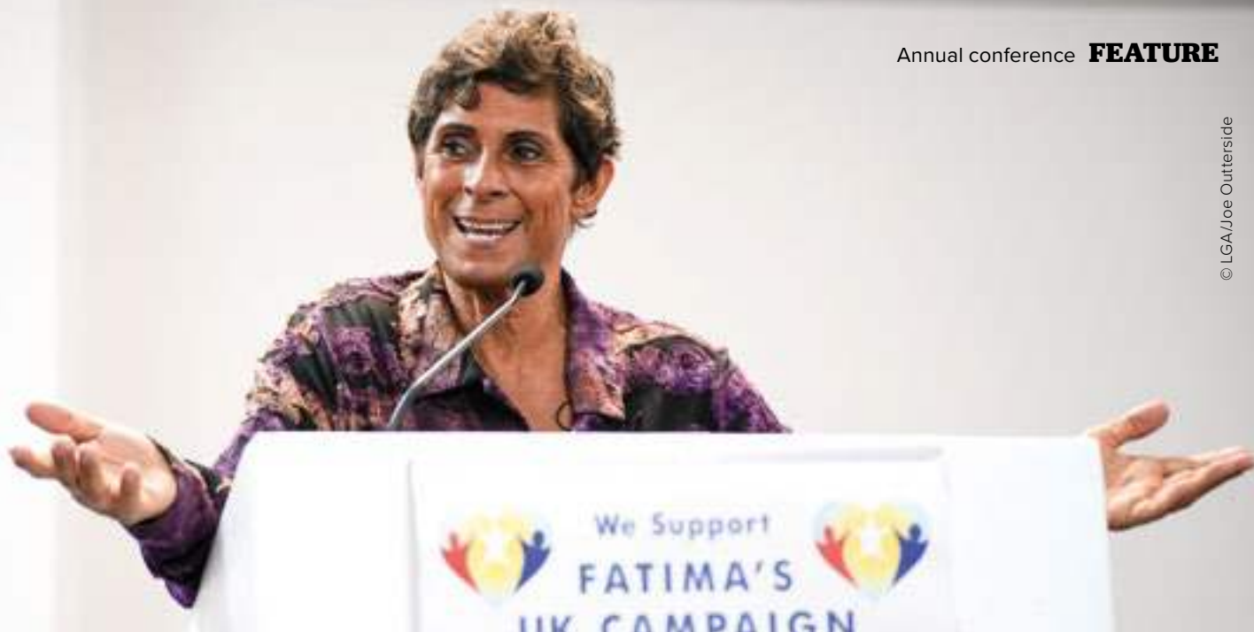
Olympic medallist Fatima Whitbread MBE