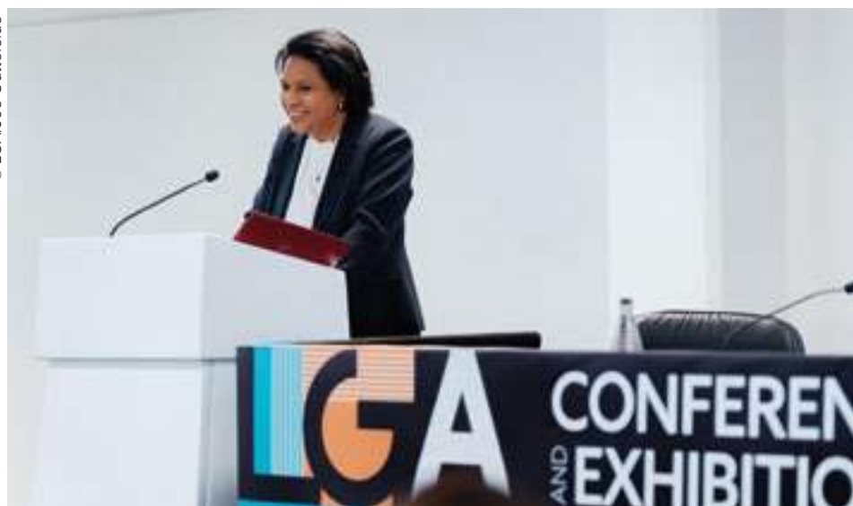
Children's Minister Janet Daby

She also welcomed the Government's focus on reforming early years, but added: "We need a focus on workforce development in early years or we won't be able to deliver the reforms." ●