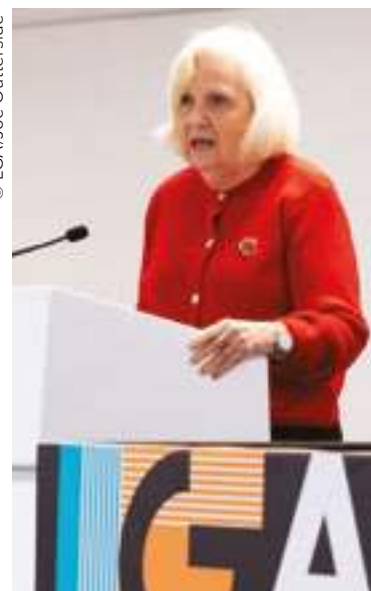
Baroness Sharon Taylor